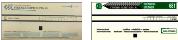
Examples of entry tickets of Autostrade per l'Italia and Brennero

a) if possible, in every bimodal lane, a ticket will be provided to lift barrier, please keep it during the journey and use it in a bimodal lane at exit station.