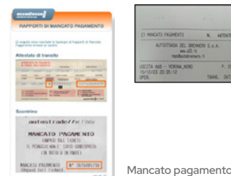
Mancato pagamento di Autostrade per l'Italia and of Brennero

NB: in the event of non-payment of the toll, the Toll Charger will initiate credit recovery procedures