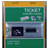
Ticket machine at Brennero

a) if a ticket was taken at entry station, at the exit station the bimodal lane has to be taken so that it is possible to insert the ticket in the machine to declare the entrance. If the OBU is detected, the journey is completed, and the barrier will lift.